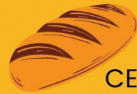
CEREALS & GRAINS