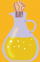
OILS & LIQUIDS