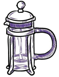
SOME COFFEE GRINDS