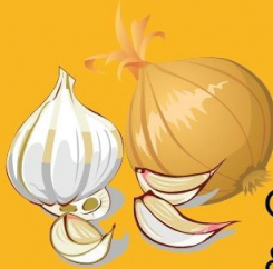
ONION & GARLIC